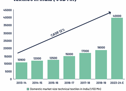
Fig. 2:Domestic market of technical textiles in India (USD Mn)

Availability of raw materials such as cotton, wood, jute and silk along with a strong value chain, low-cost labour, power and changing consumer trends are some of the contributing factors to India's growth in this sector. India's technical textiles market shows a promising growth of 20% from USD 16.6 Bn in 2017-18 to USD 28.7 Bn by 2020-21, as per the Baseline Survey of technical textile industry by Ministry of Textiles.